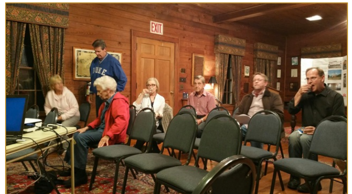
Members enjoy refreshments provided by the Fuquay Springs Questers as they listen and learn.

The 2015 membership meeting for the Friends of the Museums was hosted by the Fuquay Questers and the FV Woman's Club at the Clubhouse on Ennis Street on the night of November 17. The membership was well represented this year.