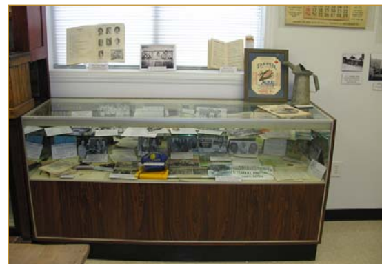
Organizations case holds many artifacts of interest.