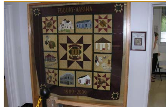
Centennial Quilt display is an interesting "history" lesson courtesy of the Willow Bees.